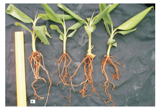
Plate 2: Secondary hardened plantlets a) Red soil + Sand + Cocopeat(1:1:1), b)Red soil + Sand + FYM (1:1:1:1), C) Red soil + Sand + Vermicompost (1:1:1)